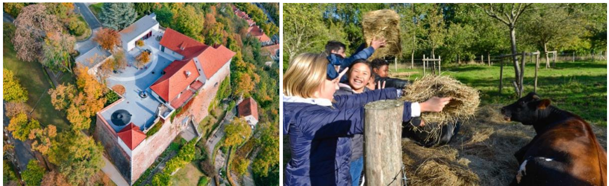
Photo credits: Left: Whole area of the museum, Photo: Mario Prevolnik © Graz Museum Schlossberg / Right: Heritage in action. Participation local schools Photo: Tine De Wilde ©

Photo credits: Left: “Normal + Me 2” Photo by David Lindsay / Right: Inner Façade and yard of the Museum, Photo: Luka Qituashvili © Museum of the Tbilisi Museums Union