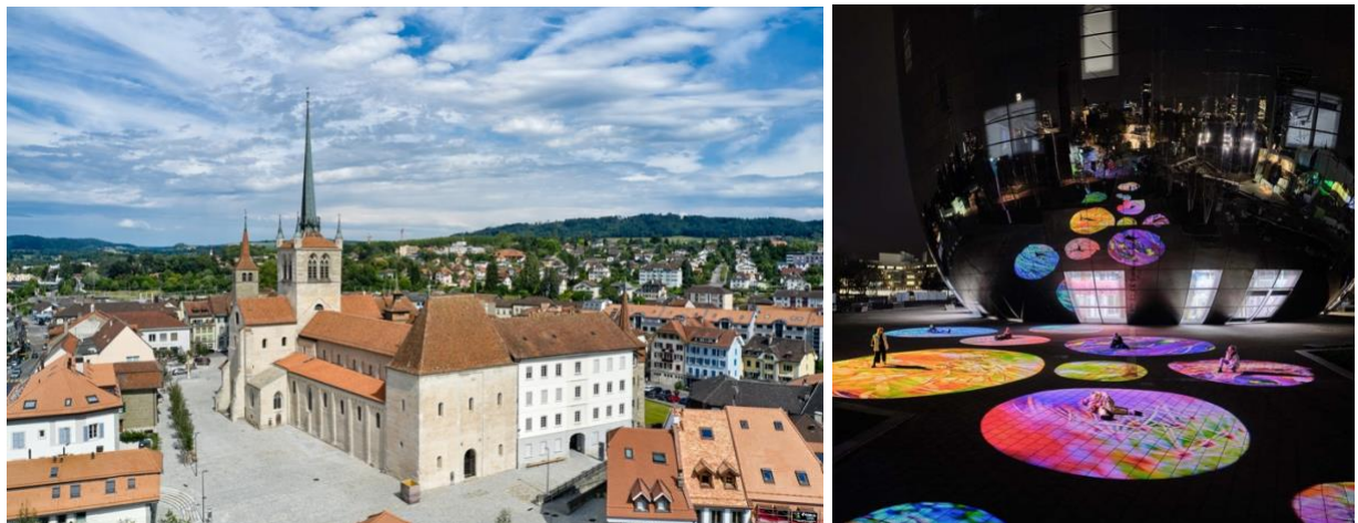
Photo credits: Left: View from the north-east © Abbatale de Payerne - Rémy Gindroz / Right: Depot by night installation Pipilotti Rist. Photo: Ossip van Duivenbode

Photo credits: Left: Whole area of the museum, Photo: Mario Prevolnik © Graz Museum Schlossberg / Right: Heritage in action. Participation local schools Photo: Tine De Wilde ©