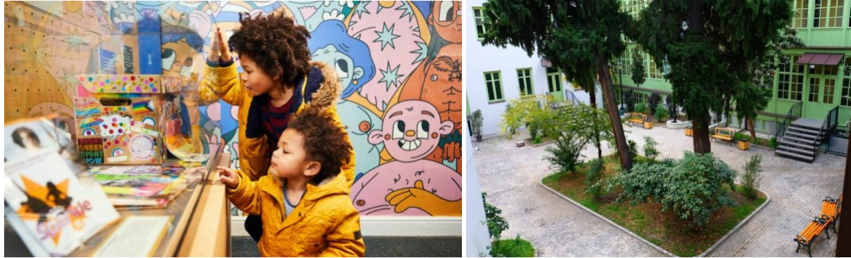
Photo credits: Left: “Normal + Me 2” Photo by David Lindsay / Right: Inner Façade and yard of the Museum, Photo: Luka Qituashvili © Museum of the Tbilisi Museums Union

Photographs of the museums receiving special commendations in 2023